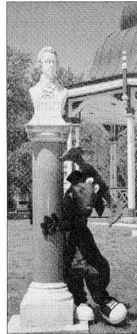
Moosic Says Please Help!

I would like to participate in the Capital Campaign for the new concert hall / headquarters!