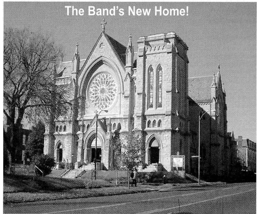
Immaculate Conception / St. Henry's Architect: Barnett, Haynes & Barnett

A Gothic building in stone, dedicated in 1908 as the newest home of an Irish congregation. It stands on Lafayette Avenue on the city's near south side, less than a block from the bustle of I-44. Three rose windows punctuate the soaring interior; stained glass windows are even found inside the bell tower (which gives the appearance that it was meant to be raised to a greater height when funds allowed.) From Built St. Louis: City Churches www.builtstlouis.net/churches/church18.html .